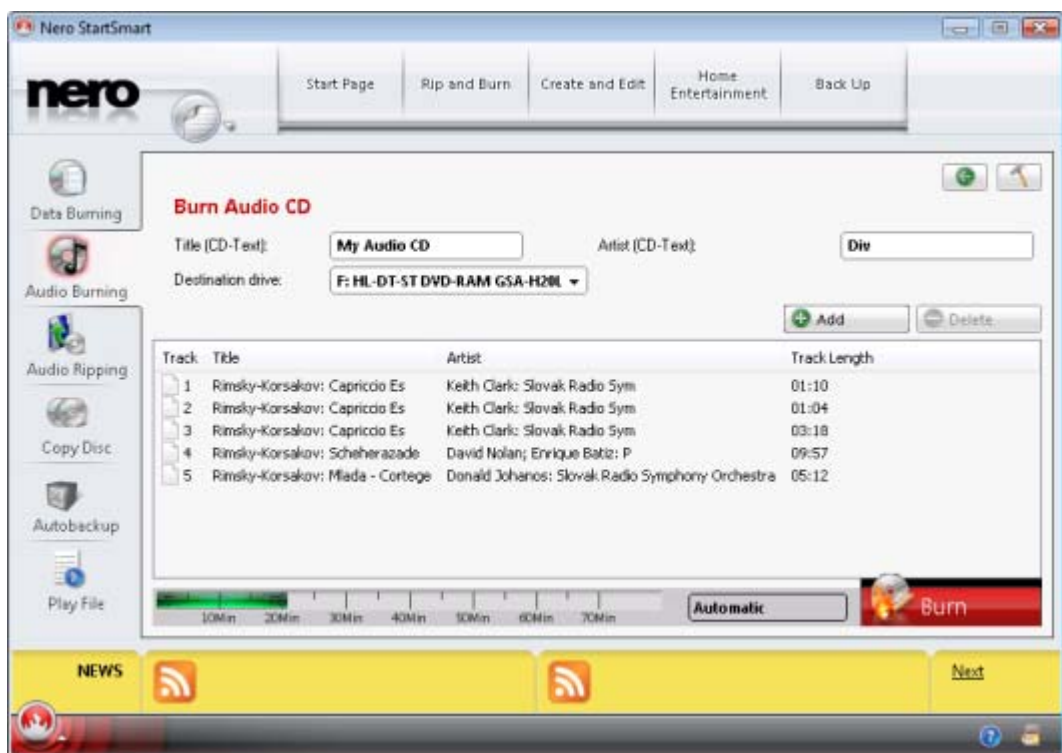
Burn Audio CD with Audio Files screen