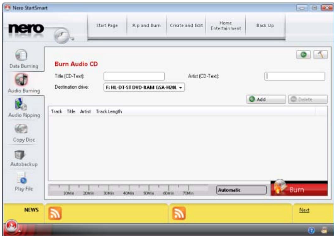
Burn Audio CD screen